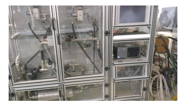
Figure 2 The DMRC Test Rig

However, there are still many parts on the DMRC Test Rig that needs to be improved and further developed for this to become complete. Figure 2 presents the DMRC Test Rig at Faiveley Transport. During the development some valves have been tested which showed a positive results.